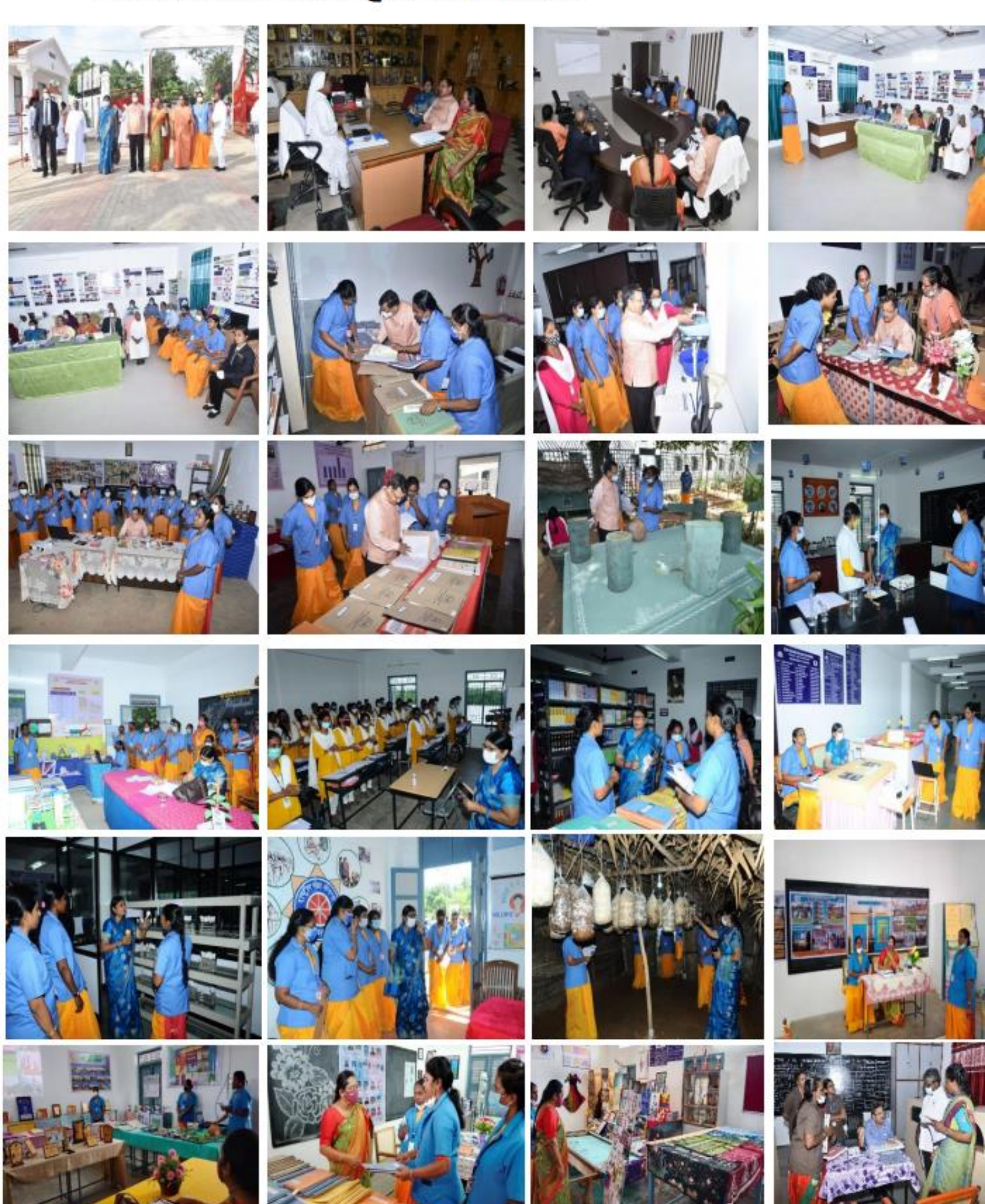
Secured A++ with CGPA 3.71