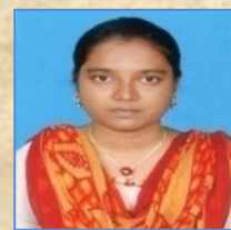
Ms. A.MONIKA SELES