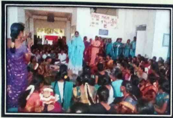
A skit enacted on the theme