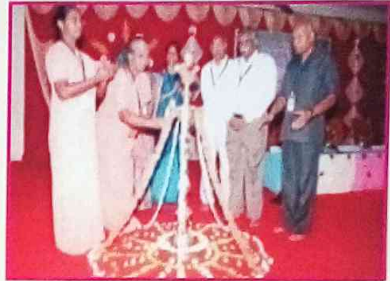
Welcoming the Guest and inaugurating the international conference